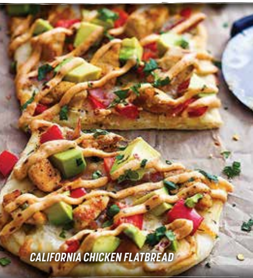
CALIFORNIA CHICKEN FLATBREAD

Bring the spirit of game day to your plate. Enjoy the famous red dog served with relish and onion. The perfect fuel for Husker Nation - 7.75 With chili - 8.75