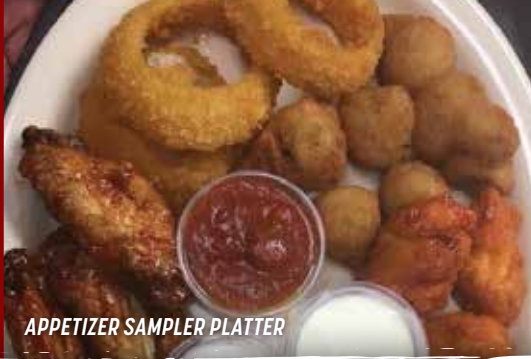
APPETIZER SAMPLER PLATTER