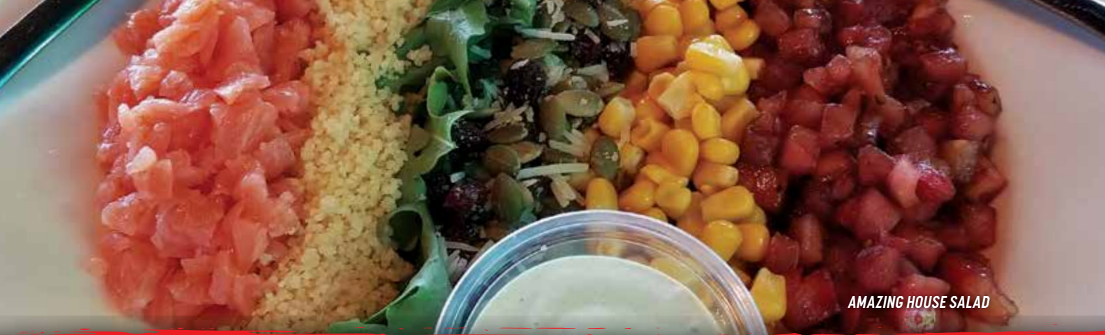
AMAZING HOUSE SALAD